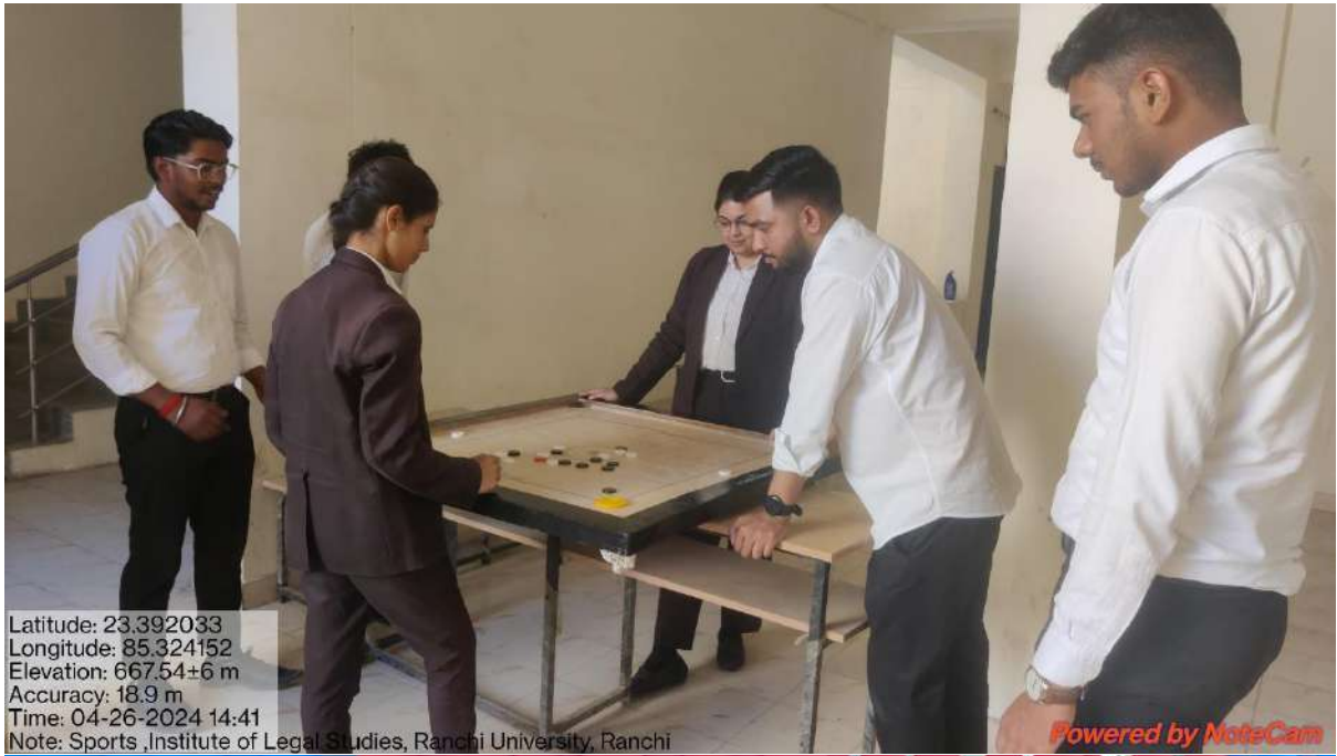
Latitude: 23.392033 Longitude: 85.324152 Elevation: 667.54±6 m Accuracy: 18.9 m Time: 04-26-2024 14:41 Note: Sports ,Institute of Legal Studies, Ranchi University, Ranchi