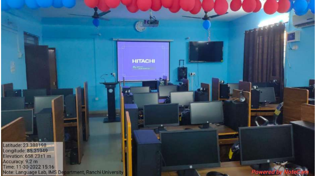
Latitude: 23.388198 Longitude: 85.31949 Elevation: 658.23±1 m Accuracy: 9.2 m Time: 11-30-2022 15:16 Note: Language Lab, IMS Department, Ranchi University