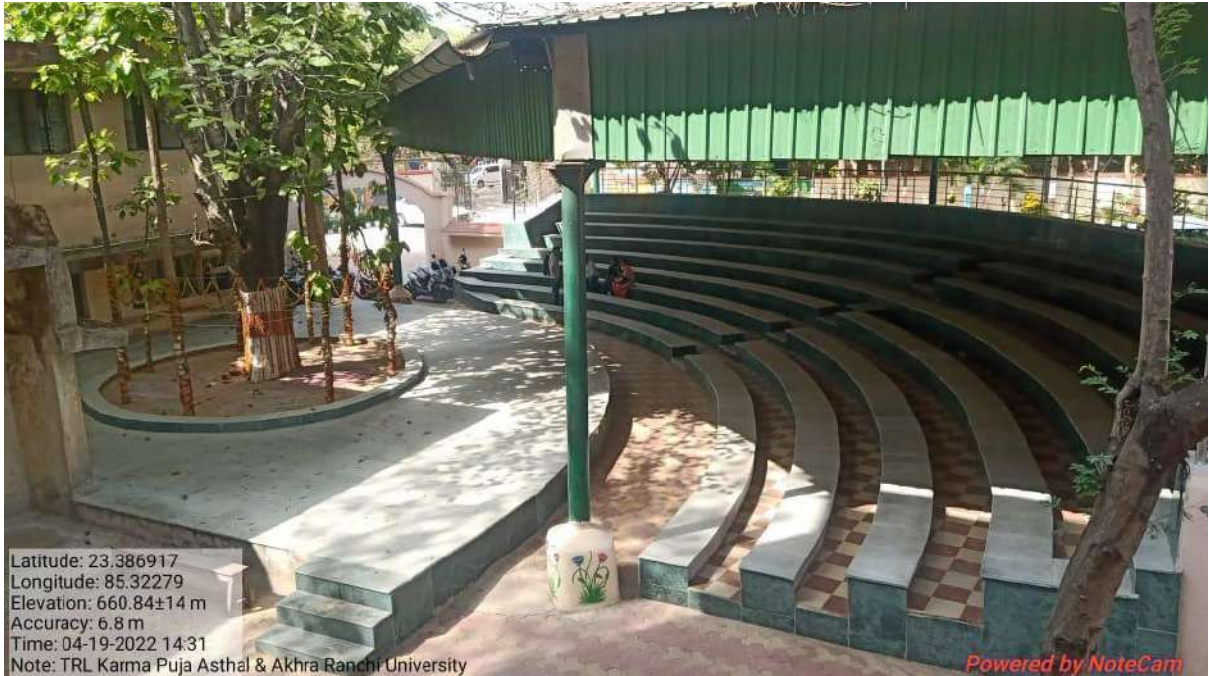
Latitude: 23.386917 Longitude: 85.32279 Elevation: 660.84±14 m Accuracy: 6.8 m Time: 04-19-2022 14:31 Note: TRL Karma Puja Asthal & Akhra Ranchi University