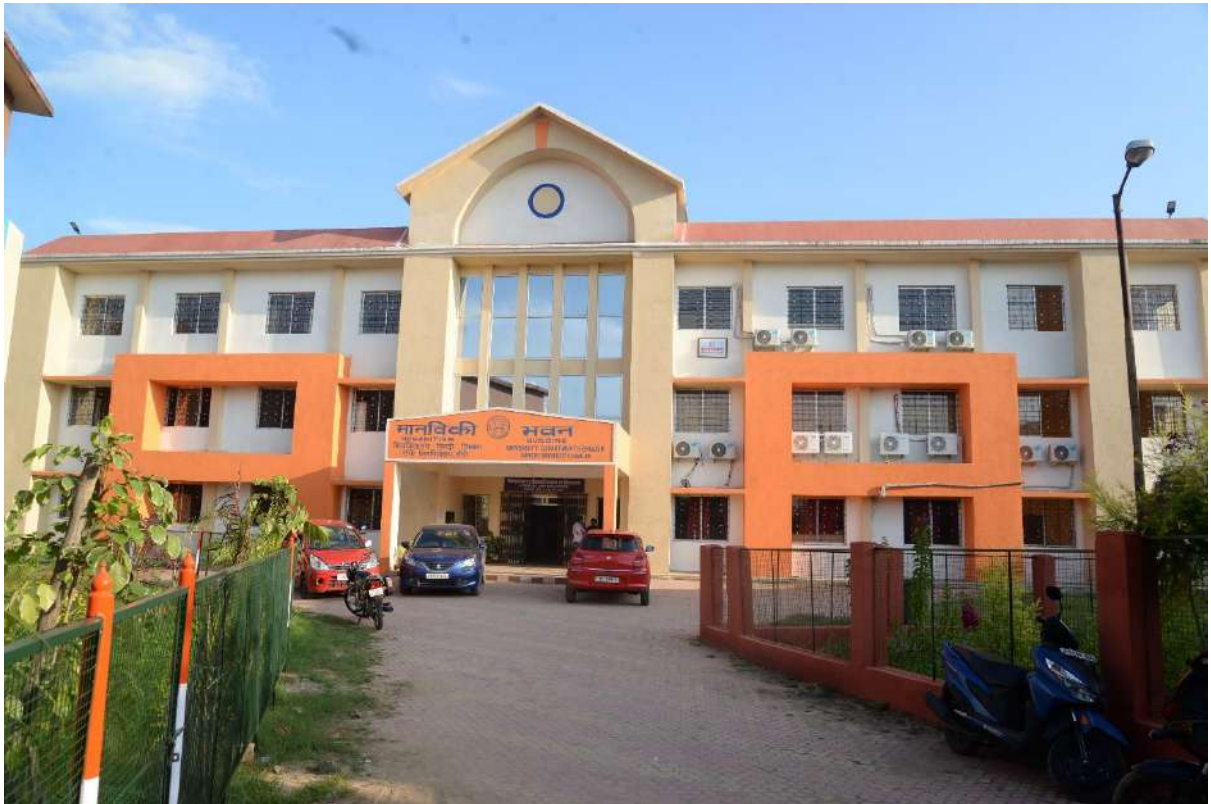
Humanities Building at Morabadi Campus