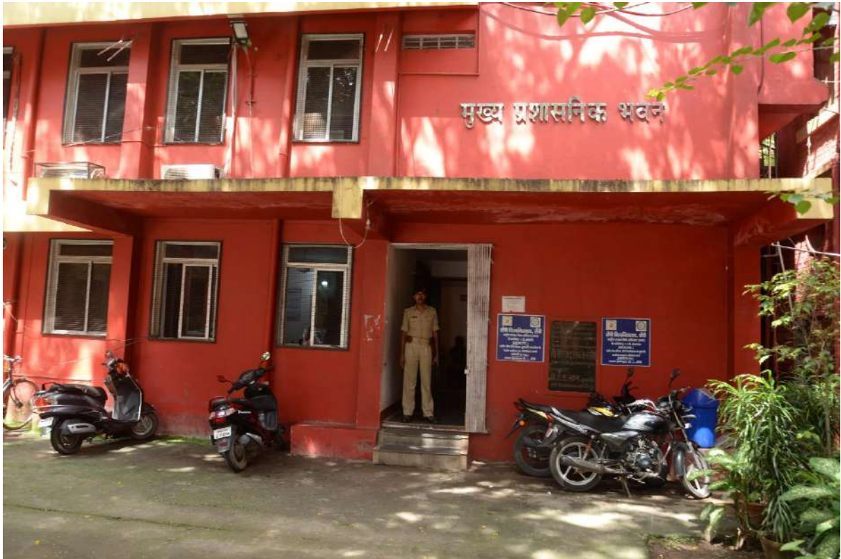
Buildings of Administrative Block of Ranchi University