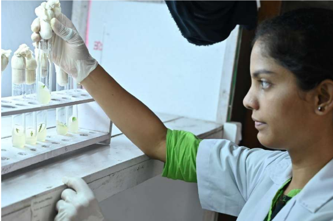
Botany and Biotechnology Labs