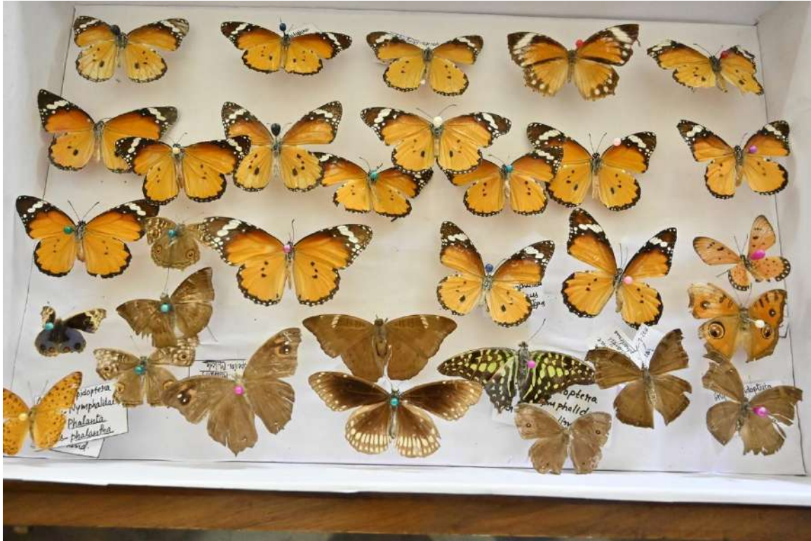
Zoology Labs and Insect Box