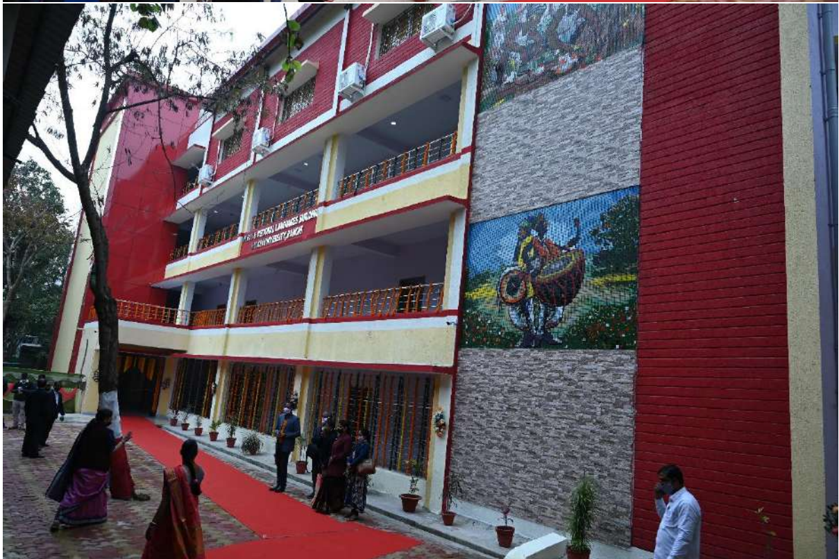
Tribal and Regional Language Departments