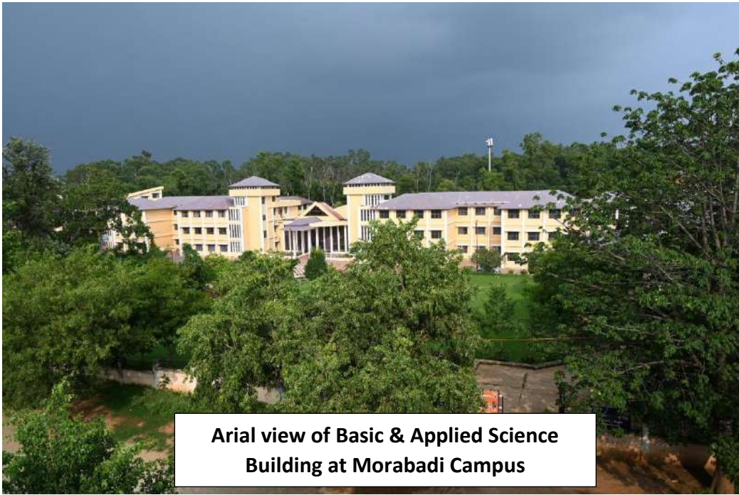
Arial view of Basic & Applied Science Building at Morabadi Campus