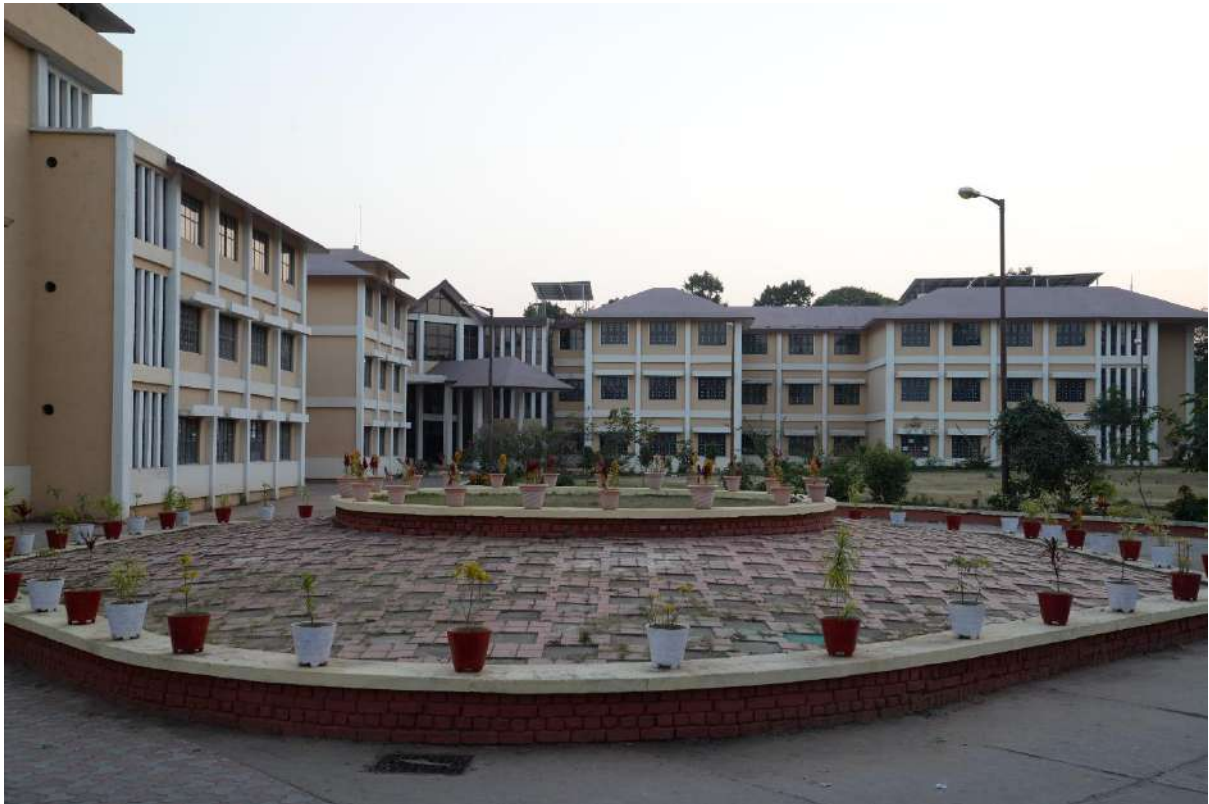
Basic and Applied Science Building at Morabadi Campus