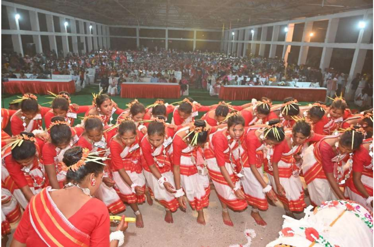
Cultural Event at Swarn Dikshant Mandap