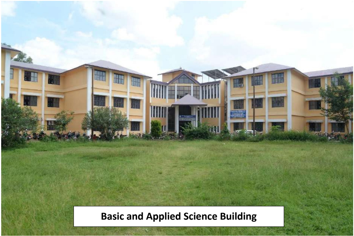
Basic and Applied Science Building