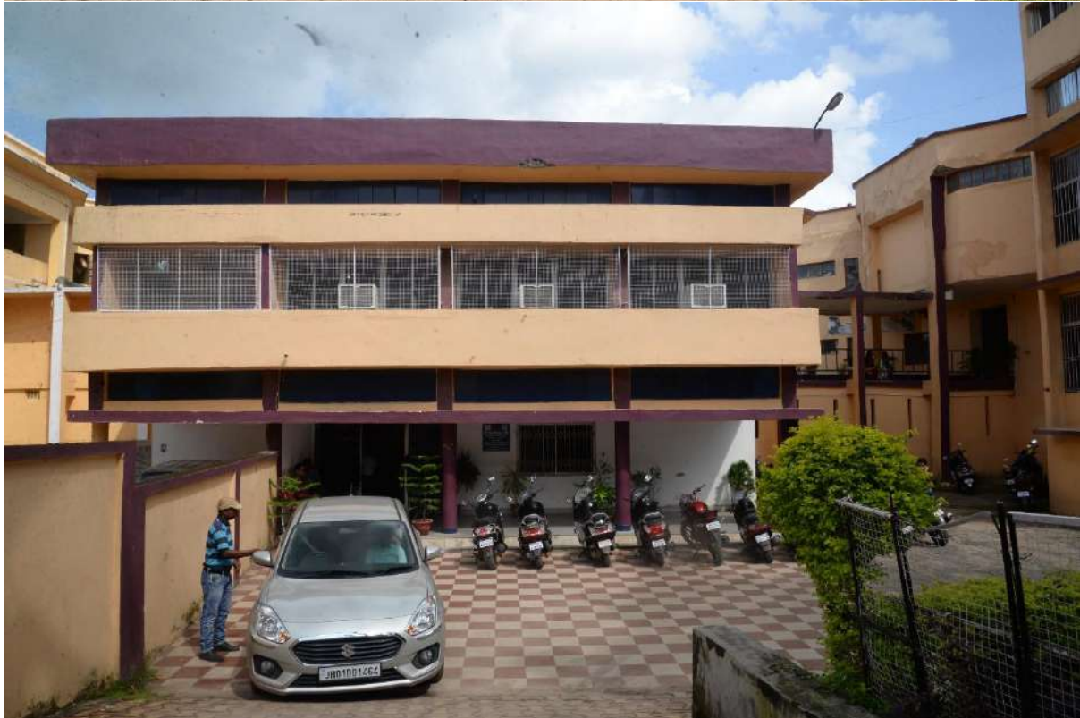
UGC-Malaviya Mission Teacher Training Centre (formerly known as UGC-Human Resource Development Centre/UGC-Academic Staff College) at Morabadi Campus