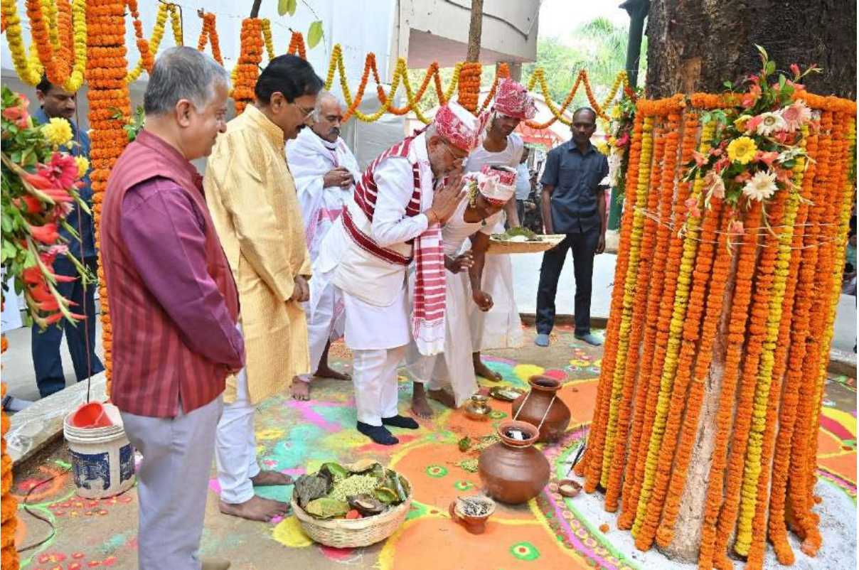
Sarhul Puja in "Akshara" at TRL Department