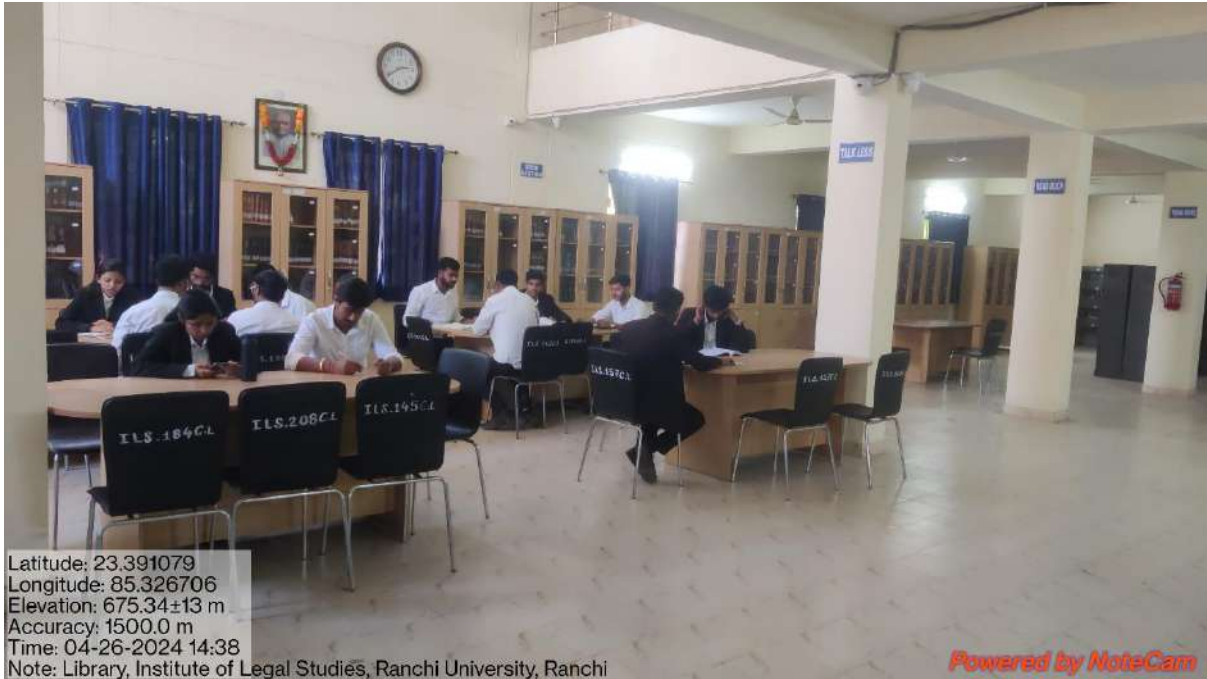
Latitude: 23.391079 Longitude: 85.326706 Elevation: 675.34±13 m Accuracy: 1500.0 m Time: 04-26-2024 14:38 Note: Library, Institute of Legal Studies, Ranchi University, Ranchi