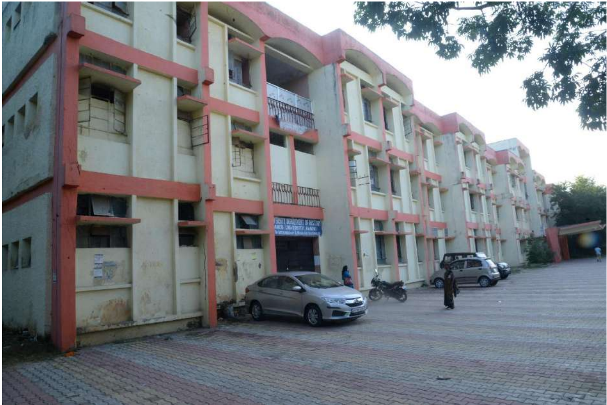
Arts Block-D Building at Morabadi Campus