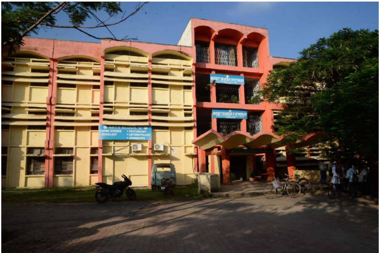
Arts Block-C Building at Morabadi Campus