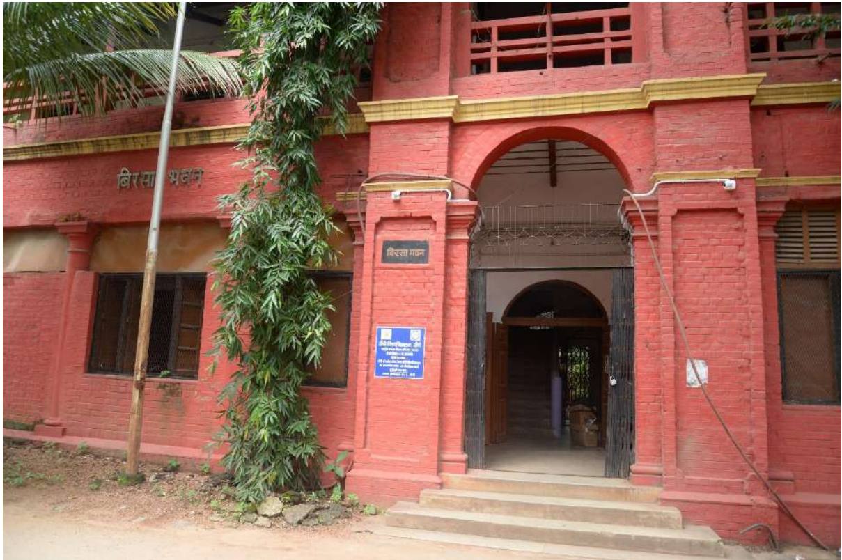
Buildings of Administrative Block of Ranchi University