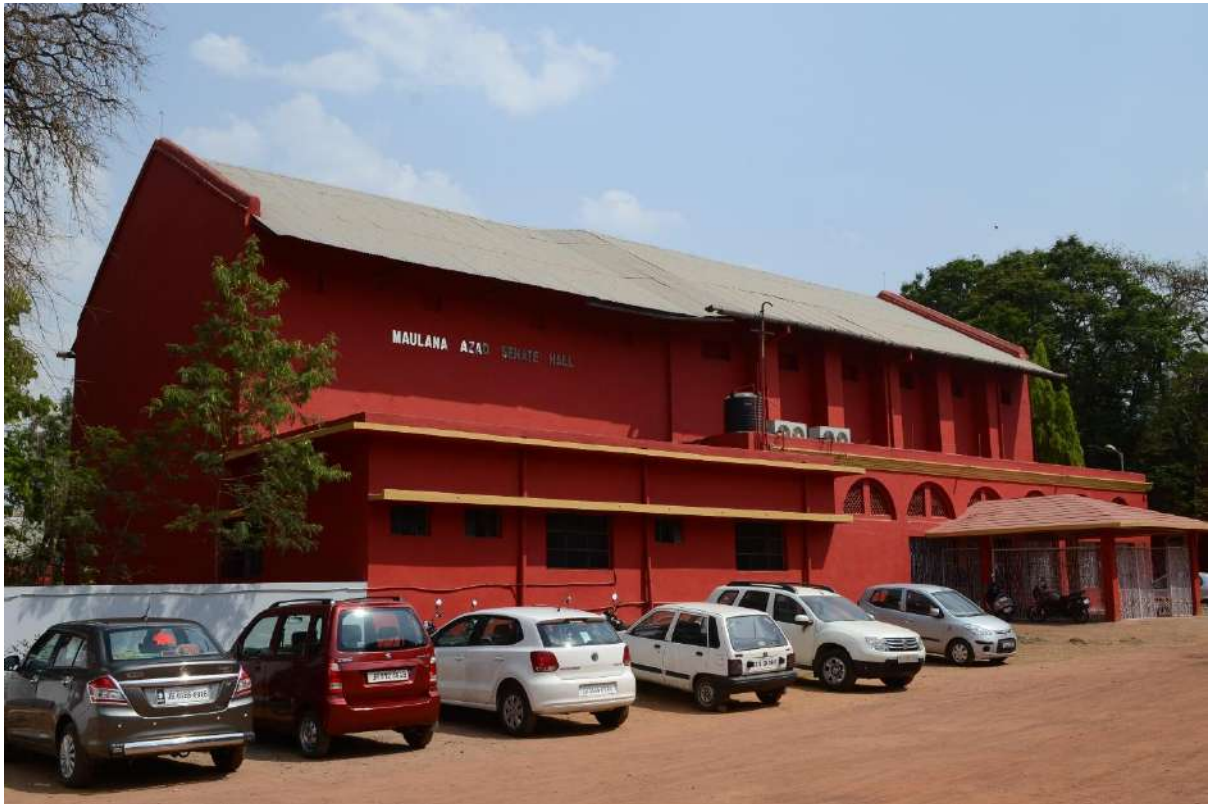
Buildings of Administrative Block of Ranchi University