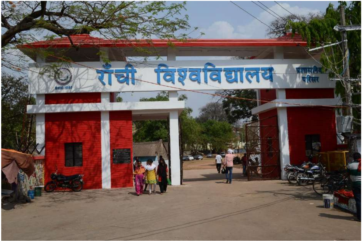
Entrance of Administrative Block of Ranchi University at Shaheed Chowk, Ranchi