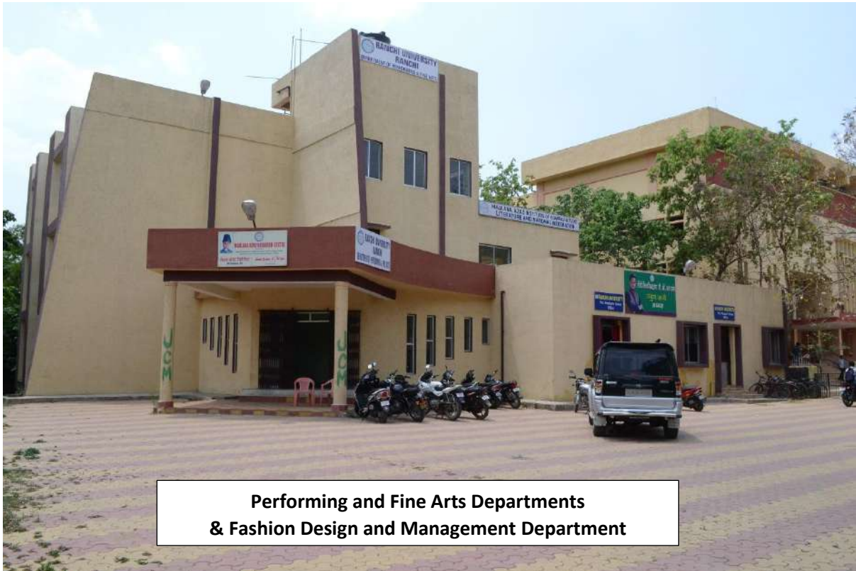
Performing and Fine Arts Departments & Fashion Design and Management Department