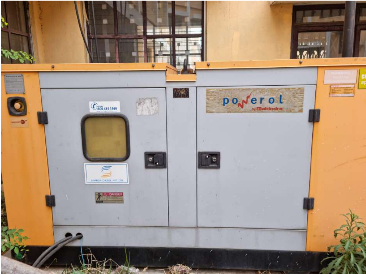
Gen-set at Basic and Applied Science Building