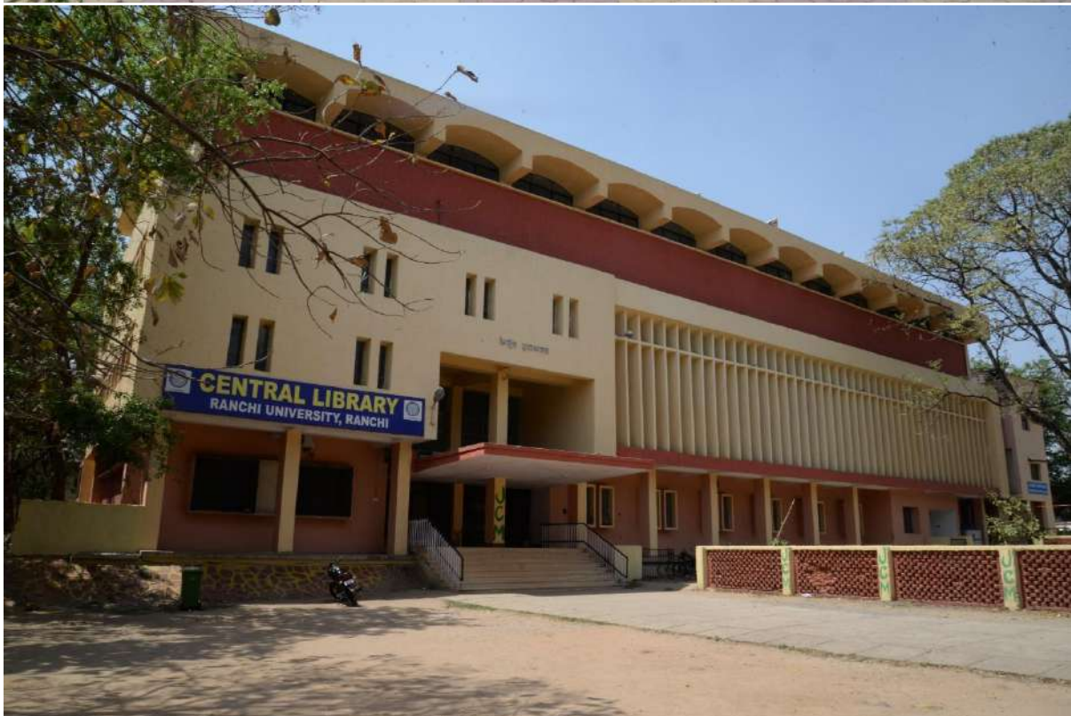
Central Library, Morabadi Campus, RU, Ranchi