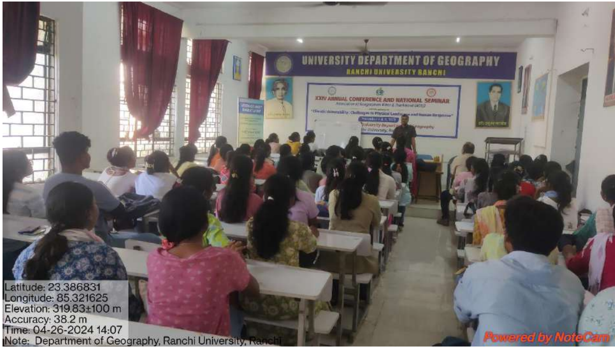
Seminar Hall of University Department of Geography