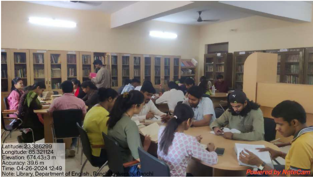
Latitude: 23.386299 Longitude: 85.321124 Elevation: 674.43±3 m Accuracy: 39.6 m Time: 04-26-2024 12:49 Note: Library, Department of English, Ranchi University, Ranchi