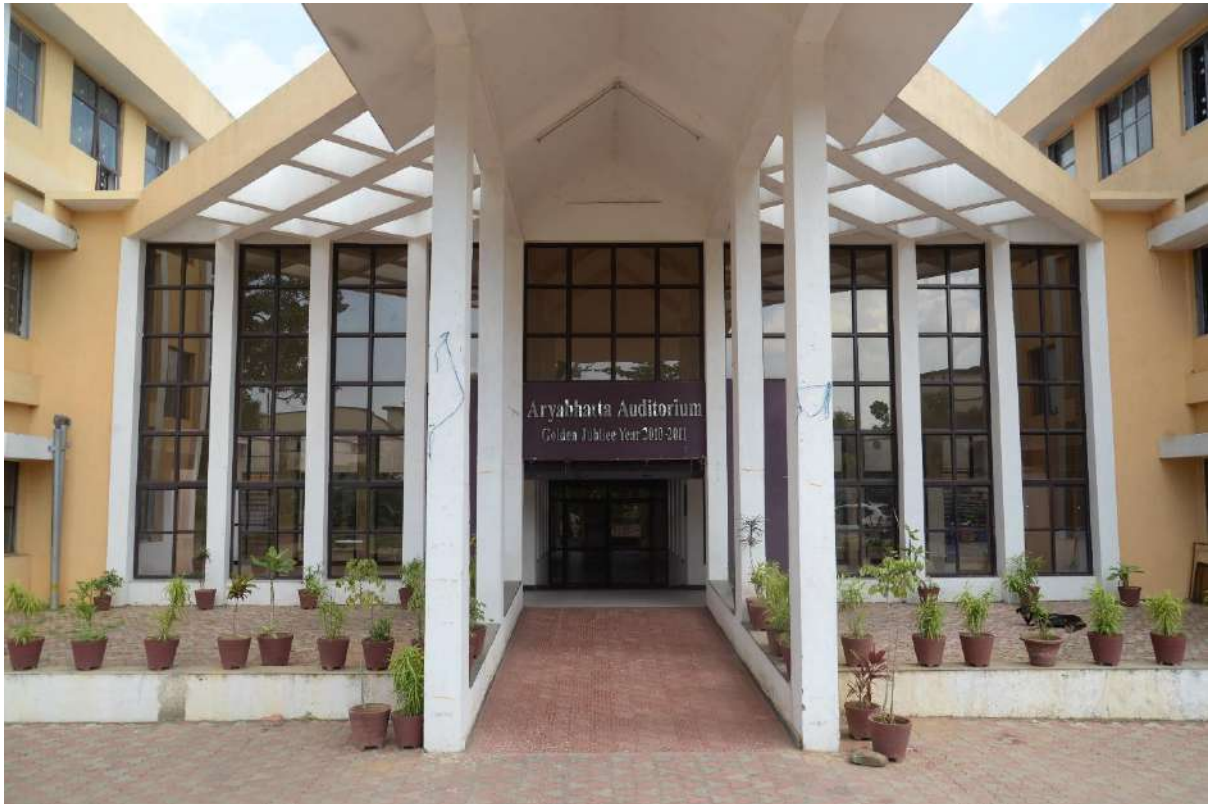
Aryabhata Auditorium situated in Basic and Applied Science Building at Morabadi Campus