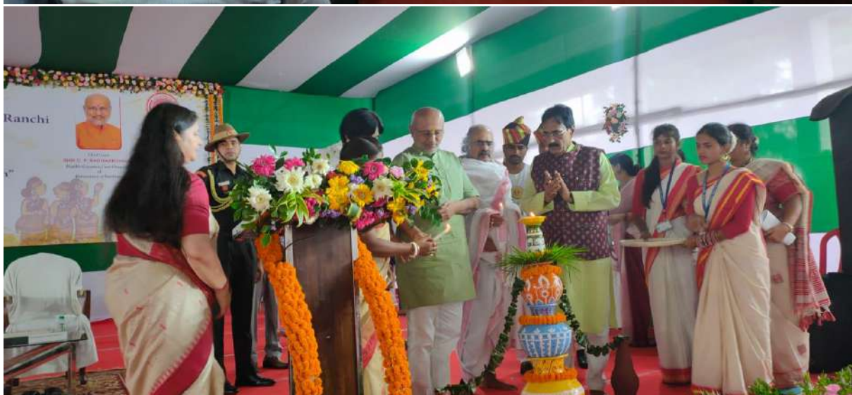
Vishwa Adivasi Diwas at Swarn Dikshant Mandap