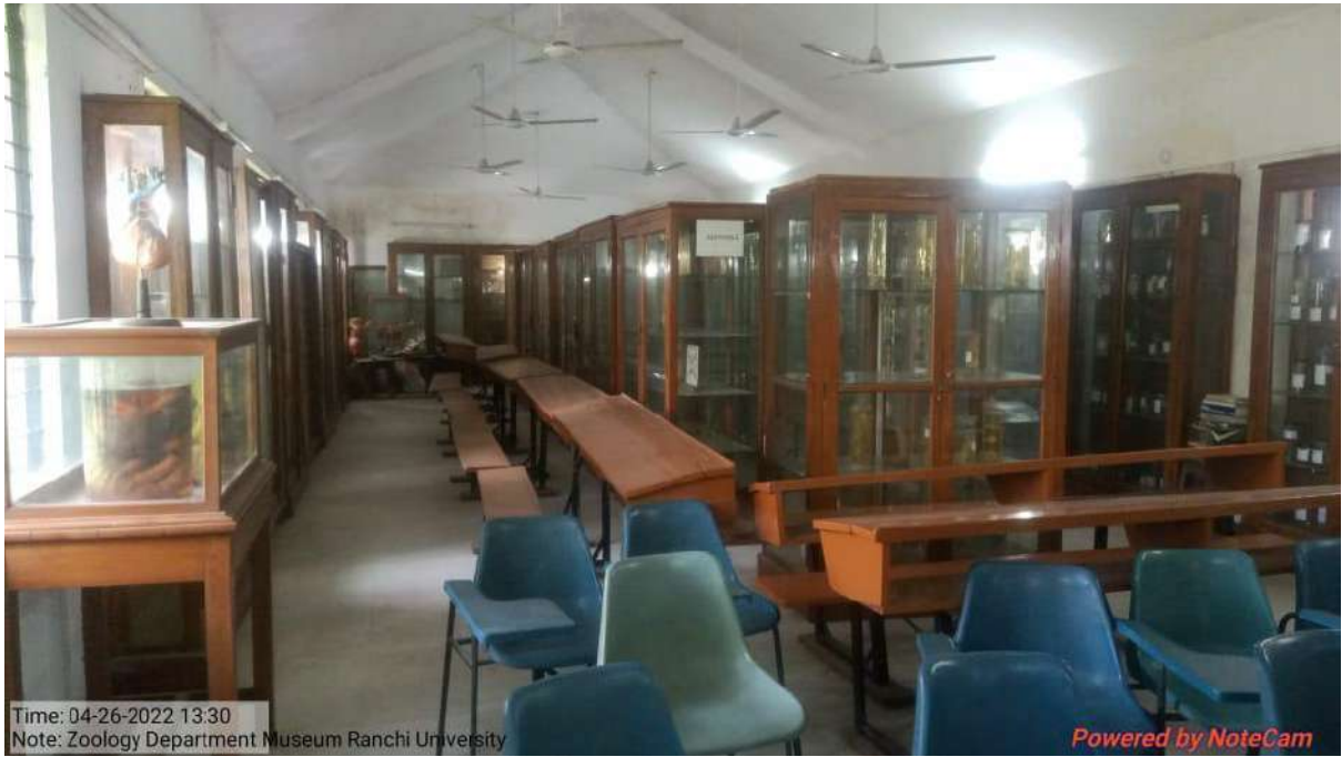
Time: 04-26-2022 13:30 Note: Zoology Department Museum Ranchi University